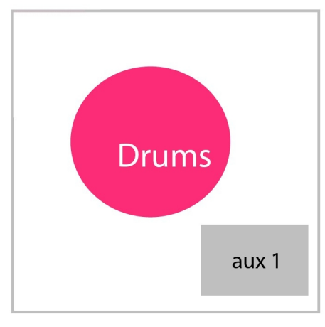
Aproximated space: 1,5x1,5m